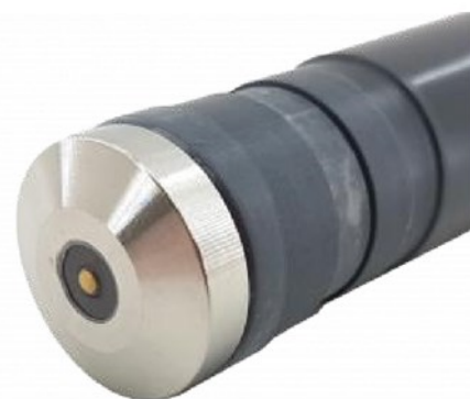
Peracetic Acid Sensor

PAA has been primarily used as a cleanser and disinfectant in the food industry since the 1950's, particularly for fruit and vegetable washing due to its highly effective anti-microbial properties. All disinfectants applied directly to food must not leave harmful residual by-products, which is why PAA is so widely used in this industry around the world. Other industries in which the water cleanliness is of paramount importance have also turned to PAA for disinfection including; agricultural, dairy processing, wineries, breweries and even cooling towers.